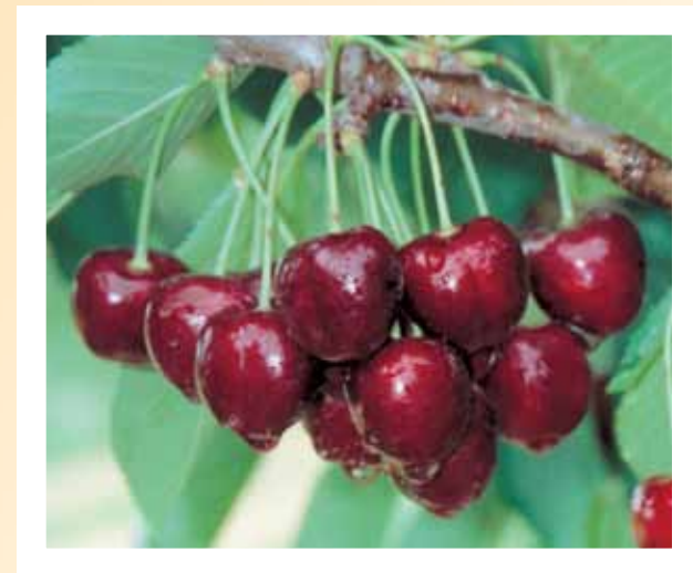
Regina USPP #11530