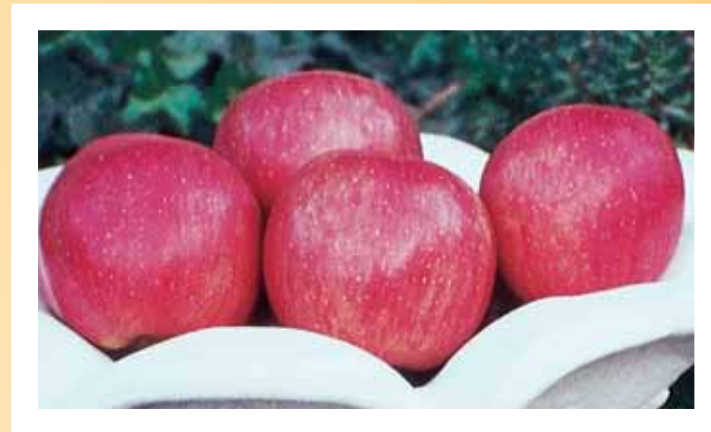
Myra Red Fuji USPP #9645

AZTEC FUJI® (DT2 Cultivar). See page 3 for full description.