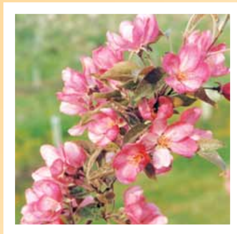
Flowers on Indian Summer Crabapple