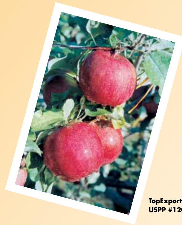
TopExport® Fuji USPP #12098

PINK LADY® brand (USPP #7880)(Cripps Pink Cultivar). Popular cultivar from Australia. Flavor best described as crisp, juicy and tangy. Cripps Pink is recommended for areas with long growing seasons. Available through C & O Nursery only by growing contract. Licensed through Brandt's Fruit Trees, Inc.®