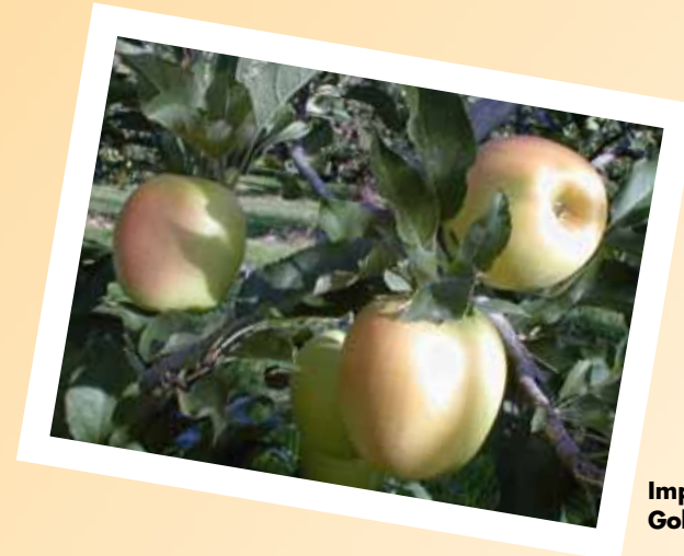
Improved Golden Delicious

RUBINSTAR® JONAGOLD (USPP #7590). See page 4 for full description.