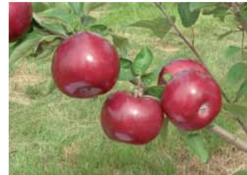
RubyMac® USPP #19891

C & O Nursery is an integral member of the International New Varieties Network (or INN). This international group of nurserymen share testing, evaluating, promotion and protection of new varieties worldwide. Look for outstanding new varieties from around the world in the near future.