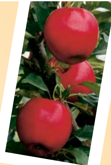
Buckeye® Gala USPP #10840